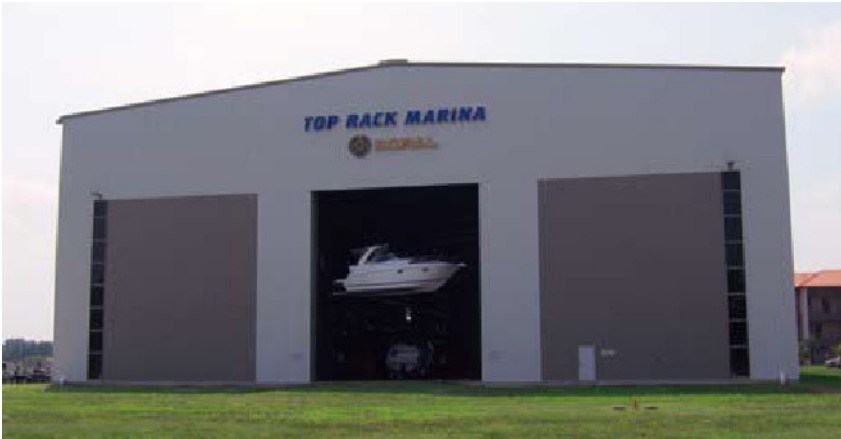
The five-level, 250-boat capacity 'boatel' at Top Rack Marina caters for boats up to 40 feet.

It wasn't long thereafter that integrated fuel management within marina management solutions was available from multiple vendors in the marina industry.